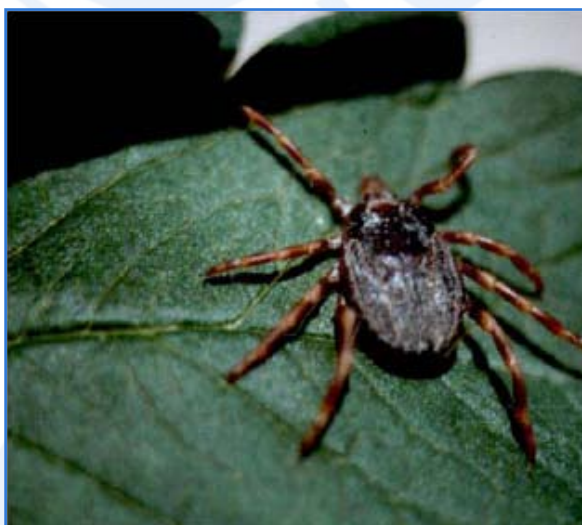
Fig. 1: Hyalomma marginatum marginatum

with more severe symptoms and a increased mortality rate, probably caused by a higher level of exposure to the virus (1, 2, 5, 6)