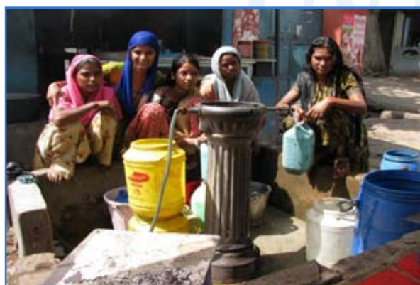
Figure 4: Queuing for water is a daily affair

is a daily affair (Fig. 4). For someone living in an affluent area the daily demand for water is much more than 30 litres. Some residents actually enjoy more than 300 litres a day per person, depending on the area where they live. A filter takes care of drinking water quality by removing harmful bacteria from the precious liquid. There are at least 5 to 15 taps per family.