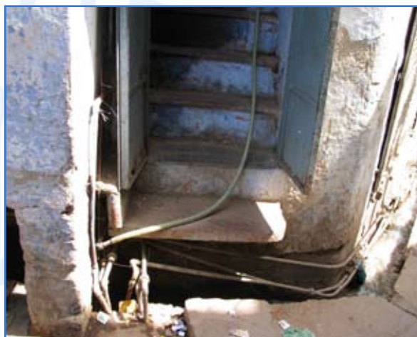
Figure 2: Ageing municipal pipes and consumer's rusted pipes

are frequent power failures and also because of leakages in the water distribution system there is generally a water crisis (Fig.2). Consumers complain that they do not receive a sufficient amount of water. The users who are far away from the main pumping stations or storage tanks do not get adequate water pressure so they illegally install booster pumps in their homes to increase water pressure. There is also significant loss of water and pressure in the distribution system as a result of public water taps which are left running or where the public tap is stolen and the water keeps on flowing.