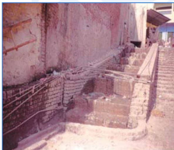
Figure 1: Municipal water supply lines

The municipality supplies water twice a day, for about 2 hours in the morning and 2 hours in the evening. During the summer months, when the water level falls and there