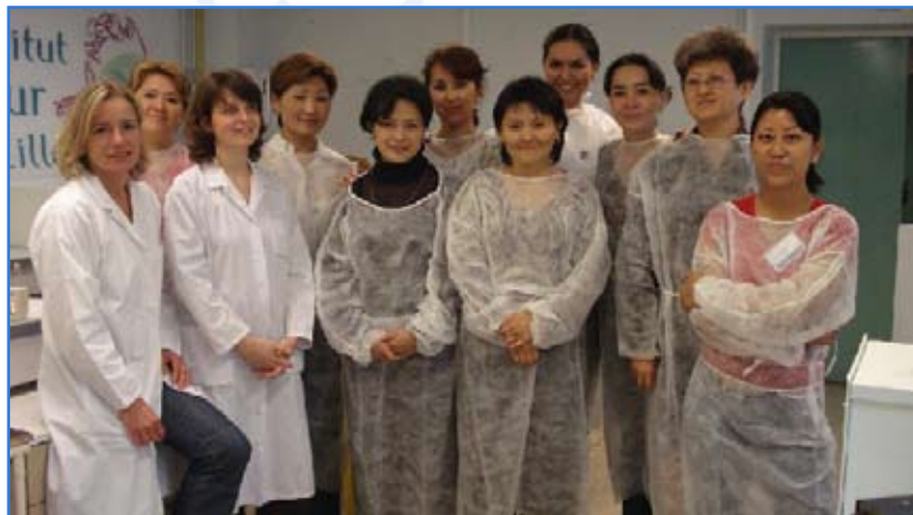
Figure3: Training_IPL French, Kyrgyz and Uzbek teams during the training at the Pasteur Institute in Lille, France

The 10 day training course comprised lectures on the microbiological quality of drinking water covering topics such as: regulations for the quality of water supplied to consumers, quality control procedures, internal quality control, monitoring of the microbiological quality of drinking water and the microbiological analysis of water from different sources. In addition, practical exercises on the process of sampling, media preparation, methods in