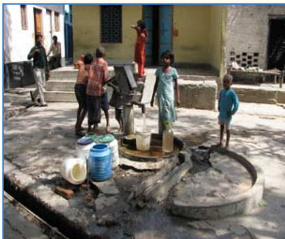
Figure 7: Roadside hand pumps are another source of water supply in poor areas

The quality of water from the public handpumps was also not satisfactory because these handpumps are drilled only 20 to 30 ft. deep (Fig. 7). The water quality is directly proportional to the depth of drilling. The upper strata of the earth absorb the waste water from sewage tanks and thus contain polluted water. Boiling water for drinking