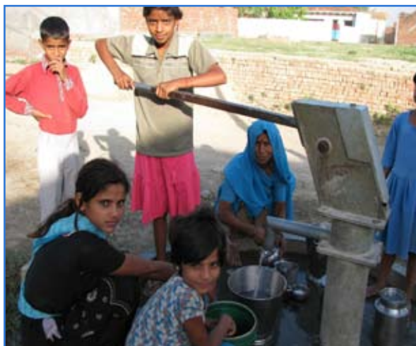
Figure 5: Women washing utensils using roadside hand pumps

Nearly 81% of the households sampled fetch water from public sources i.e. either from roadside municipal piped water connections or from roadside handpumps, because they cannot afford to have a municipal piped water connection or handpump inside their houses. Traditionally a woman is supposed to wash clothes and dishes, cook food and look after the children (Fig. 5), all activities where water is essential. Fetching water between 2 to 7 times a day falls mainly on female family members. They typically carry at least 15 litres of water on their heads. This is strenuous, especially in summer. Females reported that they have to walk 1 to 16 km per day to fetch water. Sometimes they have to stand for hours in long queues at the roadside to get water.