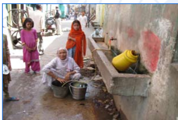
Figure 3: Sharing municipal tap water

Within Indian cities the distribution of resources is highly uneven. For a person living in a poor area, 30 litres of water a day is all one can expect. The sole source of water is either a handpump or a municipal tap shared by at least 50 other families (Fig. 3). The queue for water