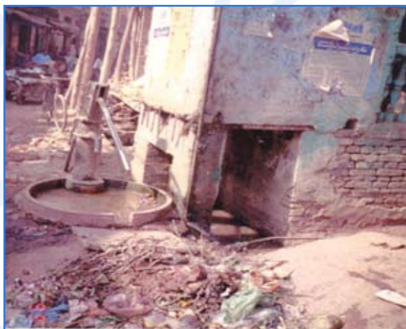
Figure 8: Water contamination due to the unhygienic location

purposes was not practiced in these households because of poverty, illiteracy, time scarcity and also because of the common perception that the overall water quality is tolerable. These people are not aware of the health risks involved in using contaminated water (Fig. 8).