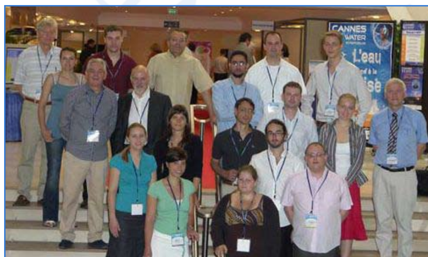
Fig.1 Participants of the Cannes Water Symposium Workshop.

different countries the opportunity to present their PhD theses and discuss them with professors and students from other universities. 16 theses from 10 universities in