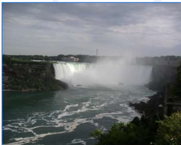
Fig.1 Canadian Falls

'Changing Environments, Changing Health' was the theme of this symposium, in which 170 papers on recently completed and ongoing research on a wide range of issues pertaining to environment and health were presented. The scientific sessions covered topics relating to environmental influences on health, risk perceptions, health inequalities, health of minority and special groups, rural health, urban health and behaviour patterns influencing health.